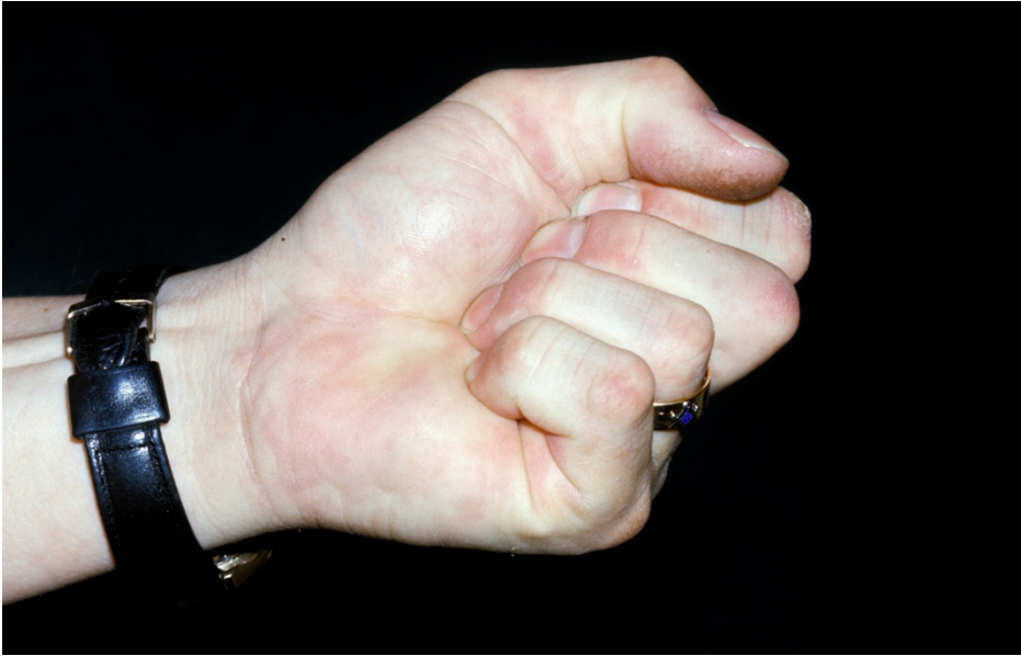
Figure 8: Preoperative patient still able to make a full fist