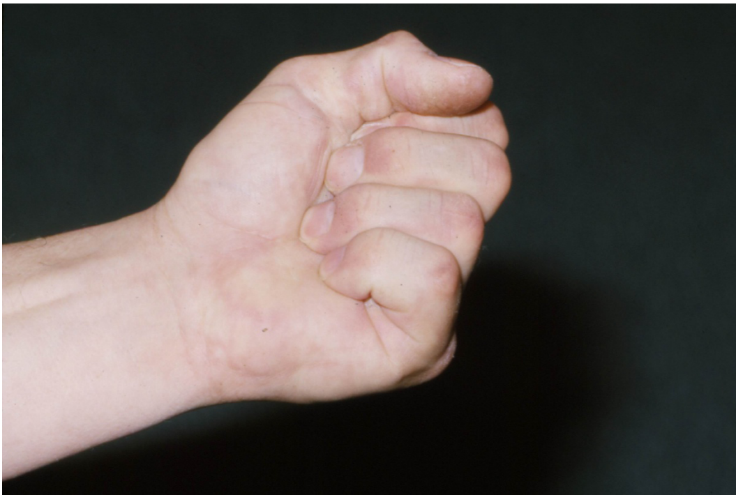
Figure 11: Same postoperative patient making a full fist