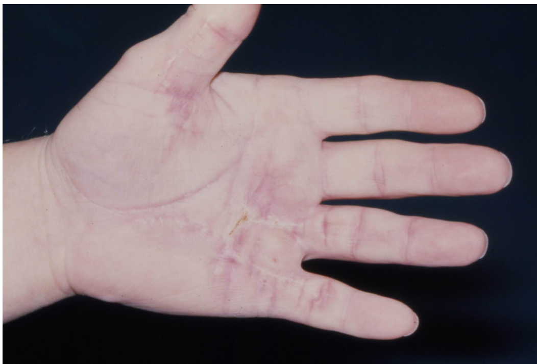
Figure 9: Postoperative patient following a palmar fasciectomy to release his left ring and small finger flexion contractures

Regional fasciectomy is the most common fasciectomy performed for the surgical treatment of Dupuytren's contracture. This procedure completely excises the diseased fascia in the palm and digits, but spares the normal-appearing fascia. This operation can be performed under block or general anesthesia with tourniquet control and loop magnification. The most commonly used incision is the zigzag or Bruner incision (26), but the mid-axial, straight-line, longitudinal incision may be used and closed with multiple z-plasties to break the straight line. Figures 9 and 10 show a postoperative patient following a palmar fasciectomy to release his left ring and small finger flexion contractures. Figure 11 shows the same postoperative patient making a full fist.