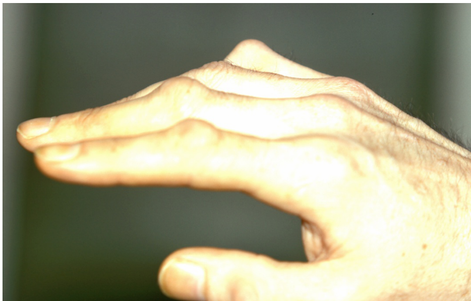
Figure 4: Knuckle pads over the dorsal PIP joints

Dupuytren's contracture is associated with other malformations of fibrous tissue proliferation, including knuckle pads [Figure 4].