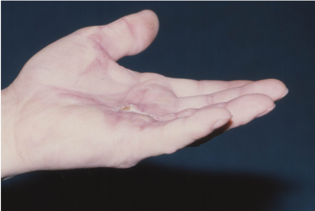
Figure 10: Postoperative patient following a palmar fasciectomy to release his left ring and small finger flexion contractures