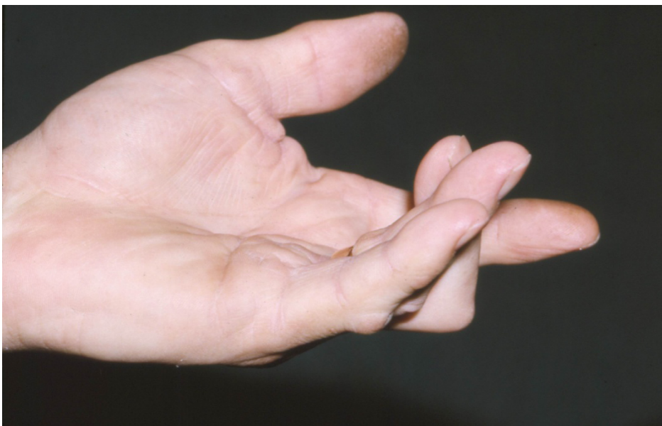
Figure 7: Preoperative patient with a flexion contracture of the small and ring finger MP joints and the small, ring and middle finger PIP joints