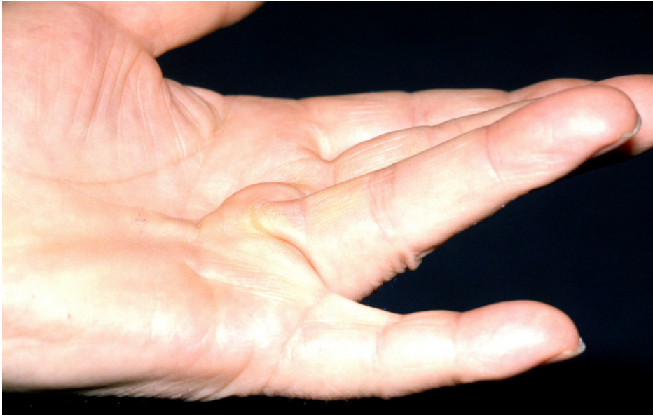
Figure 2: Pretendinous cord with flexion contracture of ring finger MP joint

The discomfort resolves spontaneously in several months. The fibrous tissue continues to grow and forms a pretendinous cord or hard band, detected on palpation, stretching from the palm to the base of a digit [Figure 2].