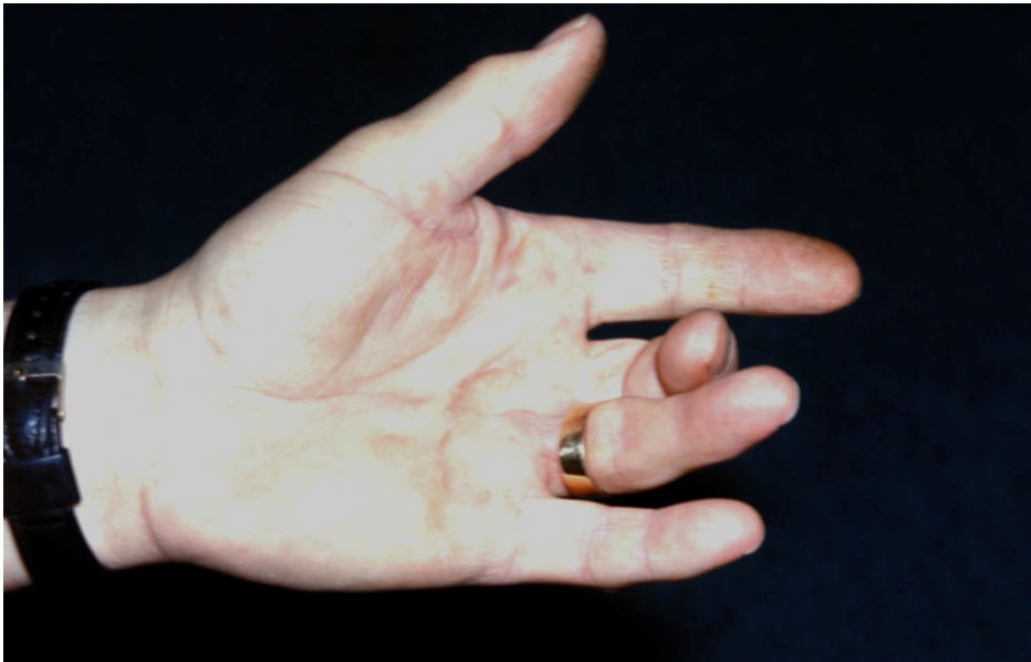
Figure 6: Preoperative patient with a flexion contracture of the small and ring finger MP joints and the small, ring and middle finger PIP joints