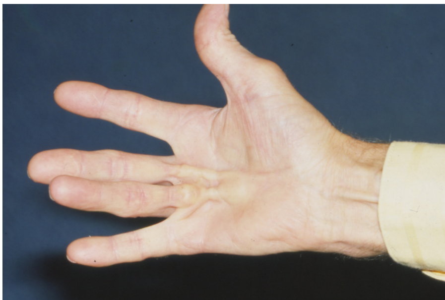
Figure 3: Natatory cords with inability to spread the ring and middle fingers

The ring finger is most commonly affected first, followed by the small finger. The pretendinous cord can contract or shorten and cause a contracture of the metacarpal phalangeal joint (MCP). As the disease progresses, the contracture may involve the proximal interphalangeal joints and, rarely, the distal interphalangeal joints. The patient can always flex the fingers into his hand, but cannot fully extend them. The natatory cord can cause adduction of adjacent digits to the extent that they cannot be passively abducted. The inability to spread the fingers apart can cause skin maceration between the digits [Figure 3].