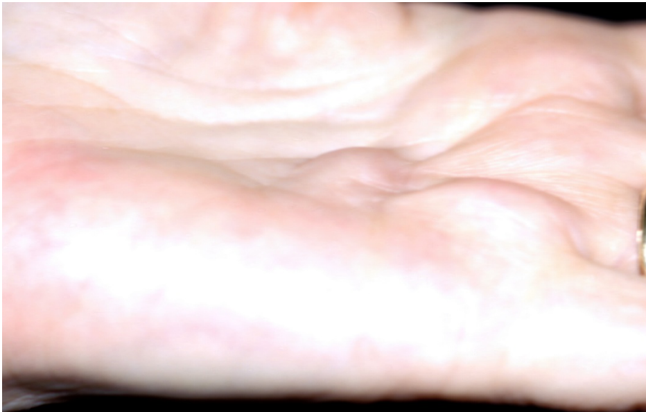
Figure 1: New Palmar nodule

The second layer down, the palmar fascia, starts to grow in Dupuytren's disease and initially forms a painful nodule in the palm [Figure 1].